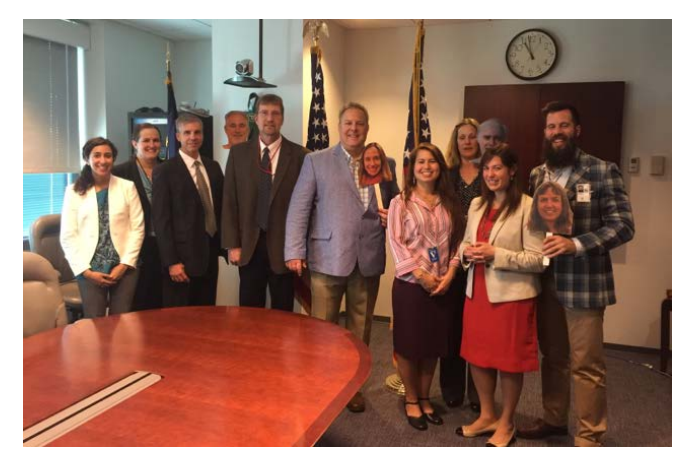
The Indiana Bat and NLEB Working Group signed the Programmatic Biological Opinion in June 2016

Here's How: To develop programmatic documents for an environmental review process, transportation agencies can partner with stakeholder agencies to discuss and document ideal processes, priorities, and frameworks. By developing programmatic documents for specific actions, agencies can expedite actions and begin moving through a well-established process. This method can be effective when bringing together stakeholders to solve multi-state challenges. In the case of the endangered Indiana bat and threatened Northern long-eared bat, highlighted in the September 2016 issue, FHWA, the Federal Railroad Administration, and the Federal Transit Administration partnered with the U.S. Fish and Wildlife Service to develop a programmatic consultation that implements a conservation strategy for bats and accelerates environmental reviews. The programmatic consultation for the Northern long-eared bat covers 37 States and the District of Columbia and it covers 22 States for the Indiana bat. It reduces timeframes for formal consultation from 135 days to 30 days, and for informal consultation from 30